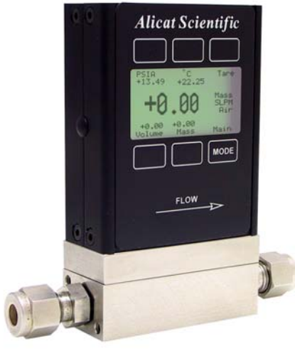
20SLPM FS Mass Flow Meter (shown with opt. fittings)