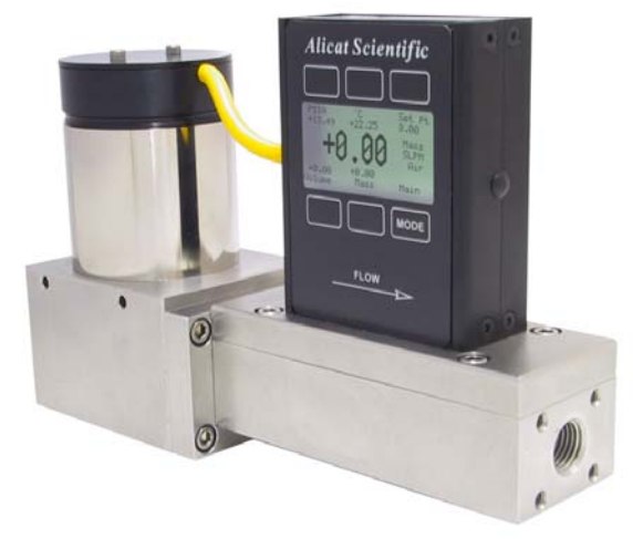
100SLPM FS Mass Flow Controller

Up to 26 units addressable, mix & match meters, controllers and pressure units!