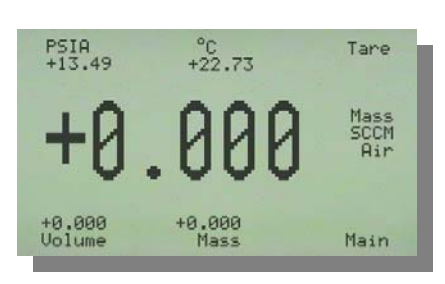
M Series Main Mode Display